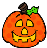
a Jack O'lantern