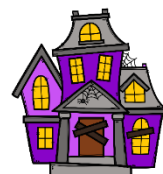
an haunted house