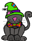
a black cat